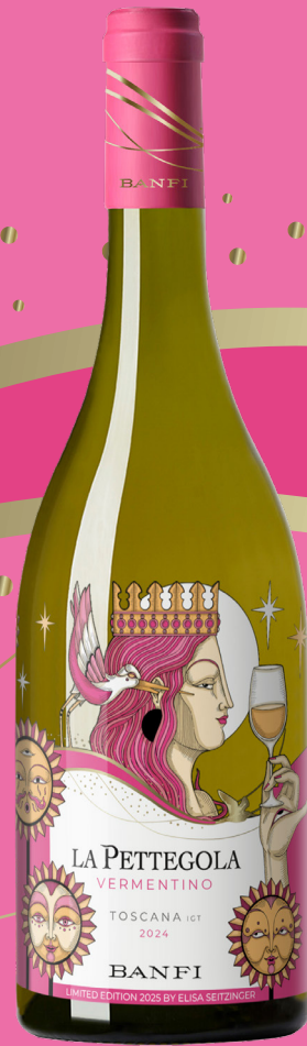
LA PETTEGOLA LIMITED EDITION